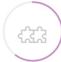
Vehicle Telemetry and CRM