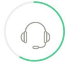
24H Operations Center